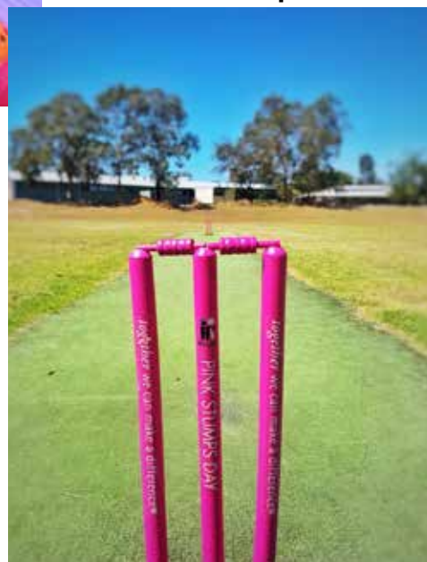
Pink Stumps Day