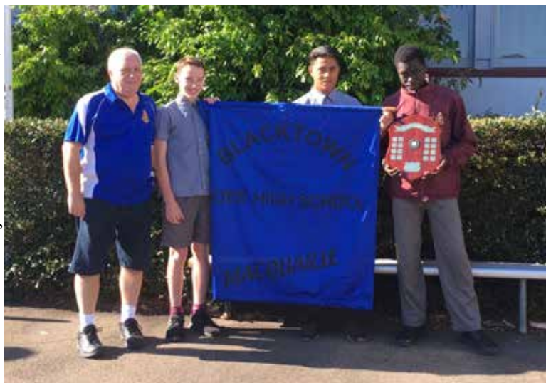
House Champions - Macquarie

Baseball game against Mitchell High, won multiple soccer games and are still continuing our run in the Bill Turner Cup, were successful in making the finals Gala Day for the Opens Basketball